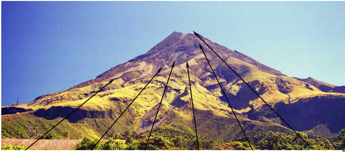
Tahurangi Hut Snow Valley Hongi's Bluff North Ridge The Lizard The Summit

Note: Hongi's Bluff is located near the head of Snow Valley and is obscured by the North Ridge. The party descended from the summit and while crossing the head of Snow Valley, slipped on the icy slope above Hongi's Bluff and slid into the valley, two sliding 400 feet towards the Tahurangi Hut.